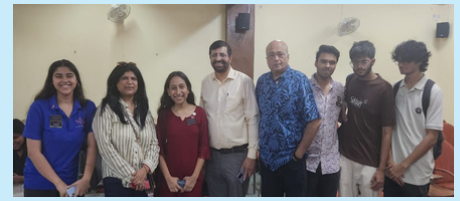
Rotary Club of Delhi West in association with Rotaract Club Of Maitreyi College and National Service Scheme, NSS, organised a Mega Blood Donation Camp with general Health Camp with Rotary Blood Bank, Faridabad, Clove Dental and Apollo Hospitals... A large number of young students availed of Medical facilities and donated blood...