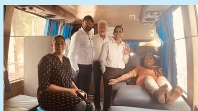
Rotary Club of Delhi West and Bharat Vikas Parishad, Dwarka organised a Blood Donation Camp at Dwarka with Rotary Blood Bank.