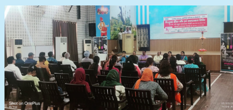
Rotary Club of Delhi West in association with Apollo Hospitals organised a Mega Health Camp with Mammography at NTPC, Faridabad