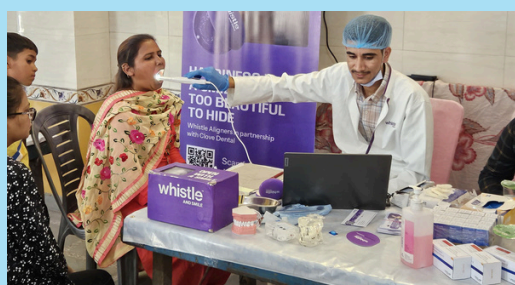
Rotaract Club Of Ingenious Minds with support from Rotary Club of Delhi West organised a Mega Health Camp at Balswa Dairy, for the benefit of a large number of underprivileged residents.