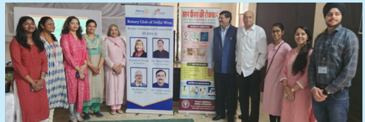
Rotary Club of Delhi West in association with Preventive Oncology, IRCH, AIIMS, organised a Breast Cancer Awareness Talk and Screenings at SSMI, East Punjabi Bagh for the benefit of more than a 100 women.