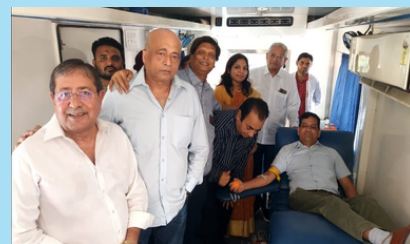
Rotary Club of Delhi West in association with Rotary Blood Bank organised a Blood Donation Camp at Rashtriya Ayurveda Vidyapeeth, West Punjabi Bagh in the presence of their Chairman & Director.