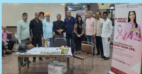
Rotary Club of Delhi West organised a Mega Health Camp at Tilak Nagar Gurudwara. More than 200 people are expected to benefit from the facilities.