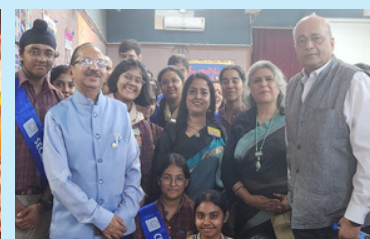
Ek Bharat Shresht Bharat, a wonderful Event by DAV Ved Vyas, Vikas Puri with a number of Interact Clubs. Rotary Club of Delhi West was one of the Sponsoring Club.