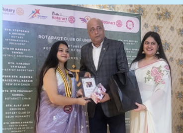
Installation Ceremony of Rotaract Club Of Unified Spirits, sponsored by Rotary Club of Delhi West.