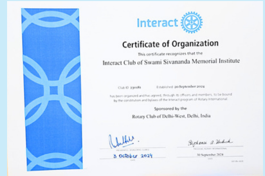
New Interact Club Sponsored- Interact Club of Swami Sivananda Memorial Institute