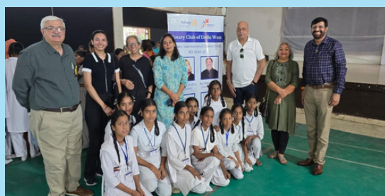
Rotary Club of Delhi West in association with The Cancer Foundation organised a Cervical Vaccination Camp at SSMI East Punjabi Bagh. 110 girls were vaccinated.