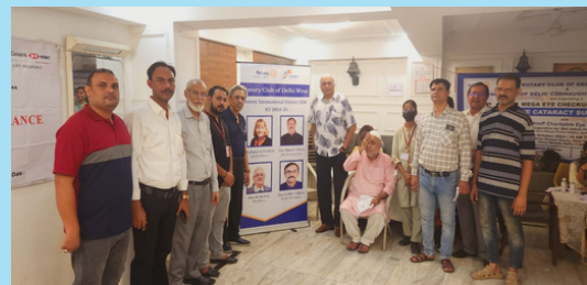
Rotary Club of Delhi West organised a Mega Eye Camp with free Cataract Surgeries in association with Shroff Charitable Eye Hospital at Jama Masjid. More than 300 residents are expected to benefit from the facilities.